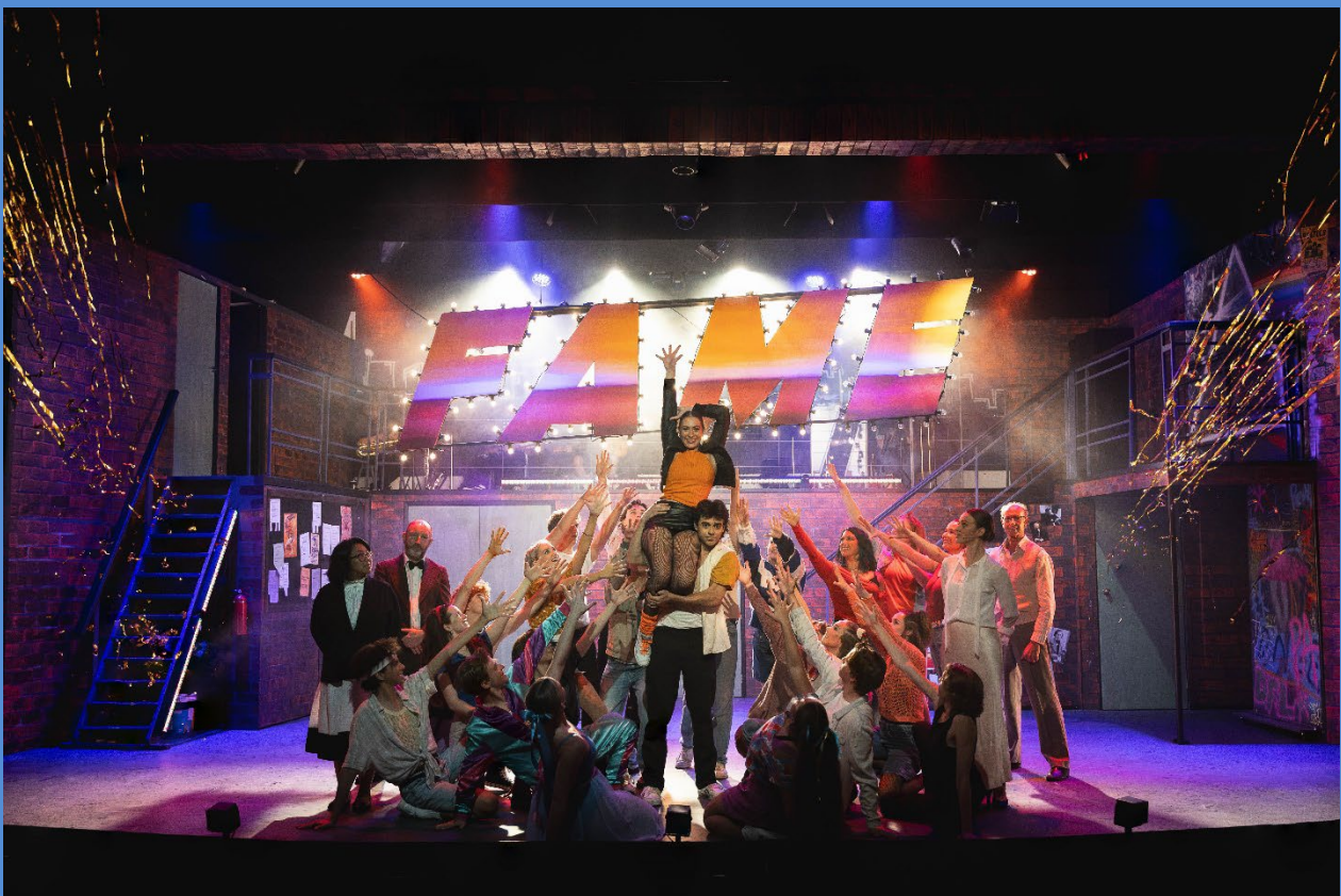
The entire cast on Stage for the finale