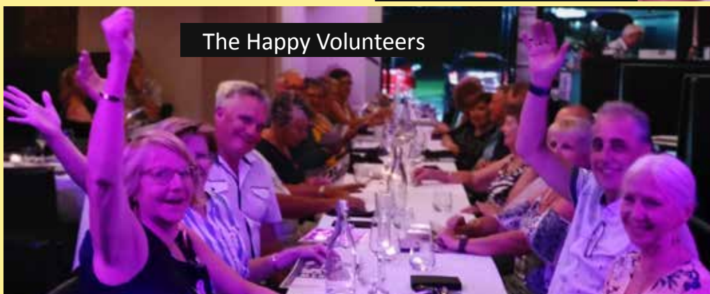
The Happy Volunteers