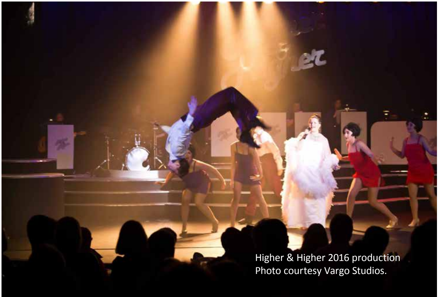
Higher & Higher 2016 production