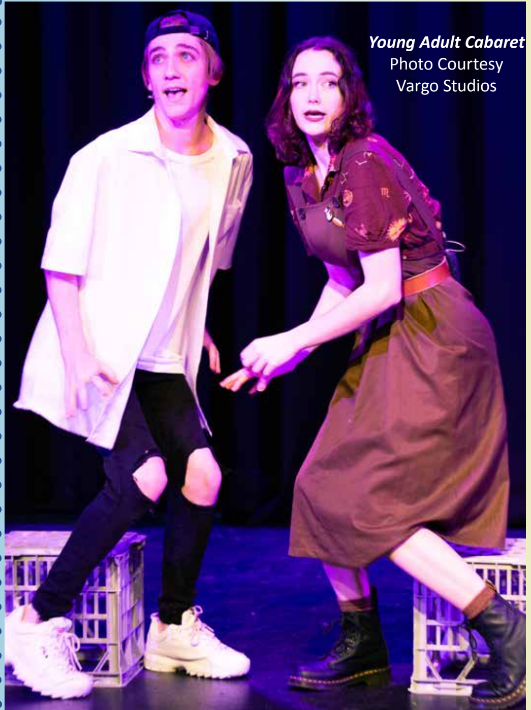
Young Adult Cabaret

THE SPOTLIGHT THEATRICAL COMPANY ANNUAL GENERAL MEETING TUESDAY 20TH AUGUST 2019 7:00pm THE HALPIN AUDITORIUM SPOTLIGHT THEATRE COMPLEX 185-7 Ashmore Rd, Benowa, Qld. Page 15 Nomination form p16.