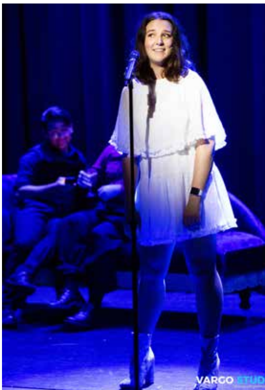
Young Adult performance

The Intermediate class performed so well. For most of the