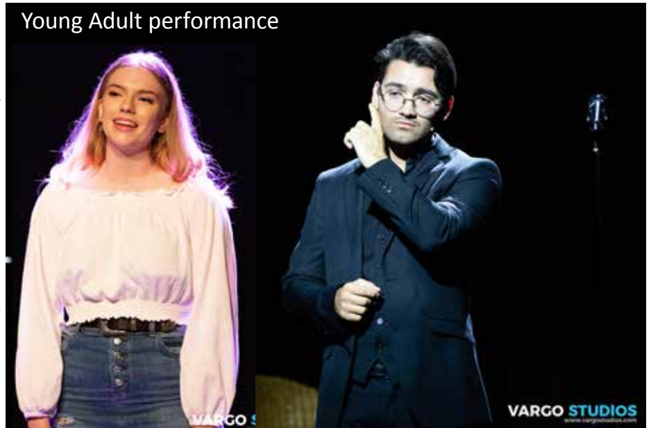
Young Adult performance

This weekend we had 100 Intermediate and Senior Music Theatre students performing on stage. The final number had 100 students in it and it was fantastic. The Senior's number Amazing Grace was just that, amazing, such beautiful voices and wonderful harmony.