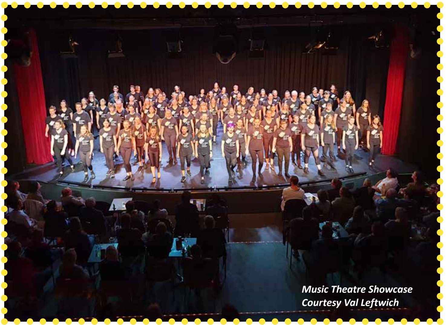
Music Theatre Showcase

students it was their first time on the big stage and they took it all in their stride.