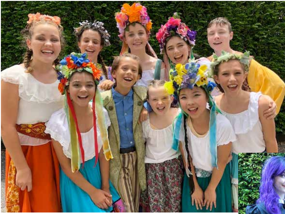
Some of the wonderful Spark & the Crystal Crusade cast posing for enthusiastic audience members and adoring children after a Matinee performance.