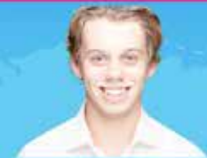
CLAY CARLAW ENSEMBLE