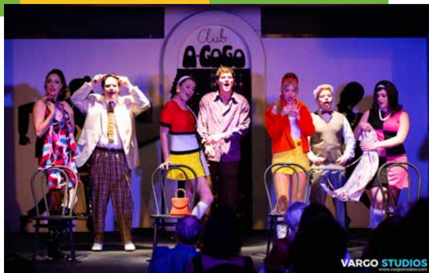
VARGO STUDIOS www.vargostudios.com