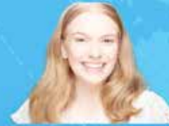
TYMYKA WINES ENSEMBLE