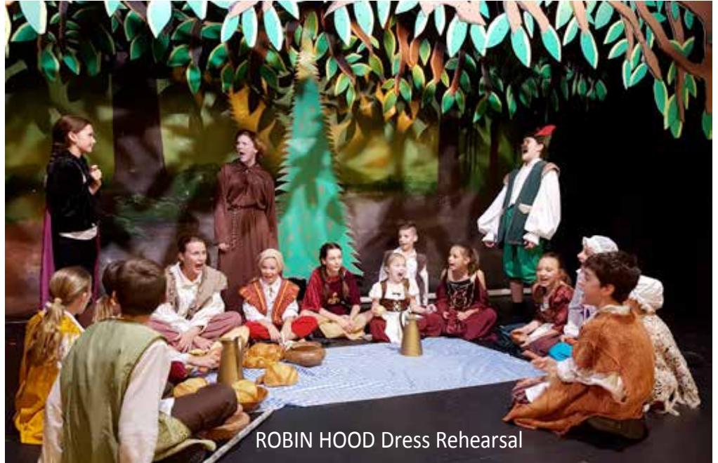
ROBIN HOOD Dress Rehearsal

It has been a very busy month getting ready for the Intermediate Drama production Robin Hood . The play took place on the 19th, 20th and 21st October and was a resounding success. Each class put their own personalities into the performances and it was such a delight to watch. The students have grown in confidence so much this year and this showed, with excellent voice projection and characterisation. Well done to all classes we are very proud of you.