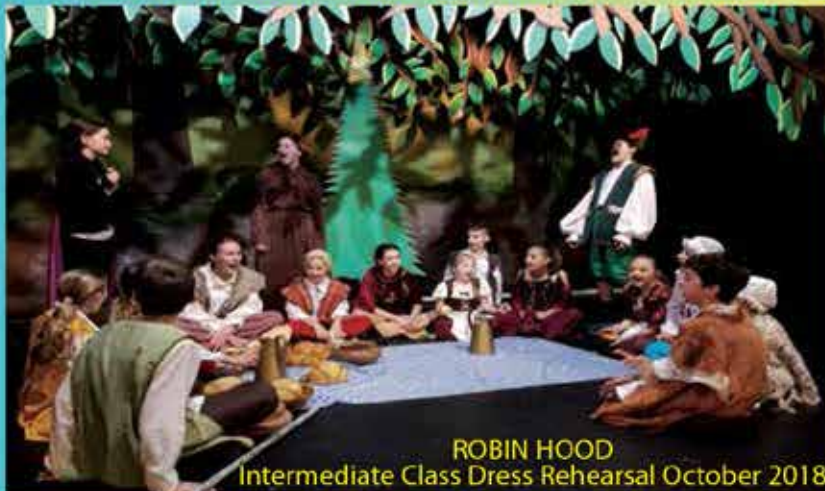
ROBIN HOOD Intermediate Class Dress Rehearsal October 2018