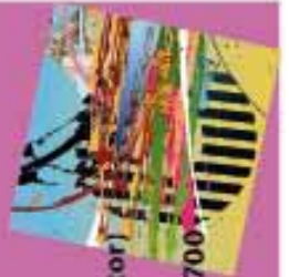
Junior Primary Class presented The Big Book, 2011

or COSTUME HIRE – 5539 4700 to reserve a place in class.