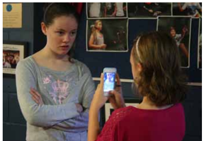
Paris looks somewhat unimpressed at Georgia's interest in photography