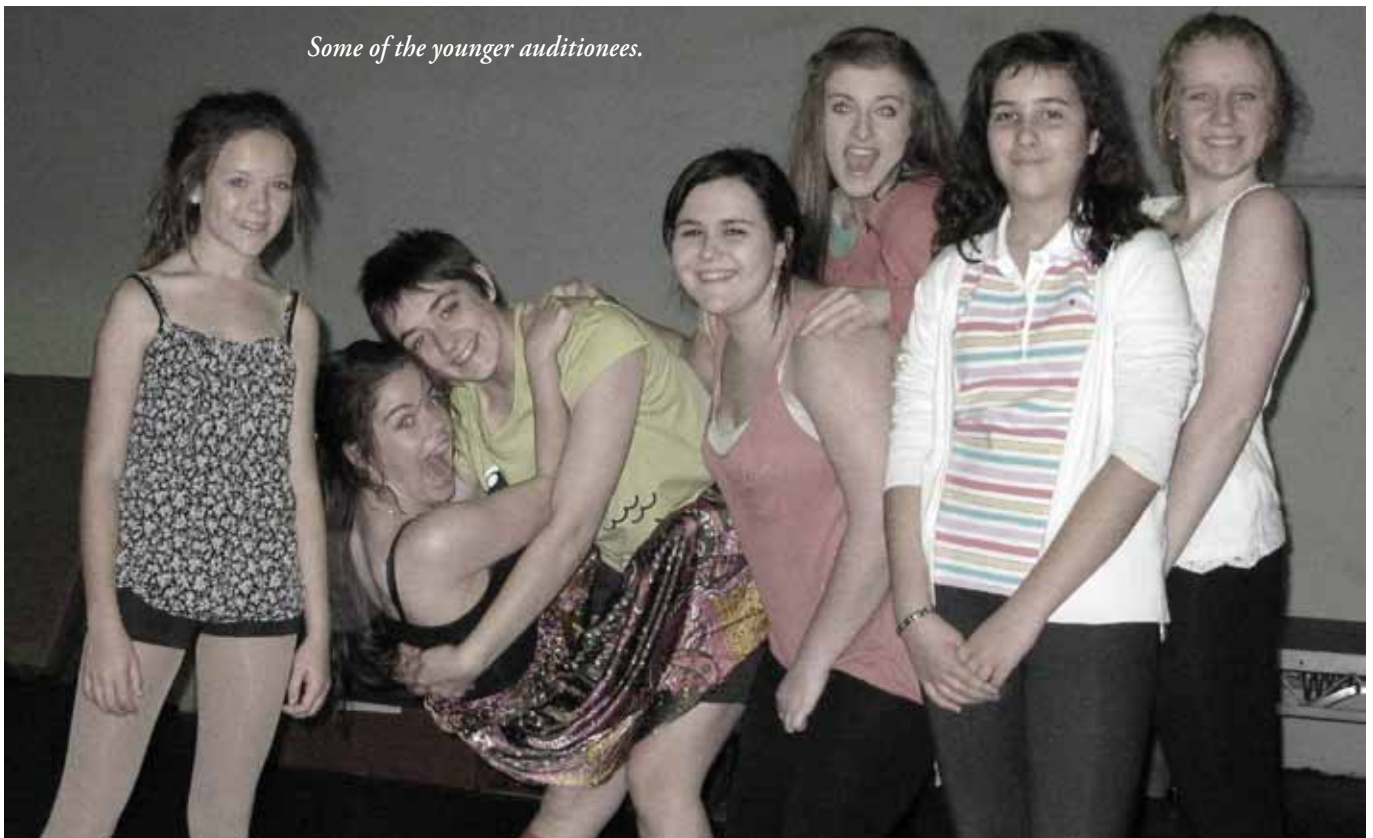
Some of the younger auditionees.