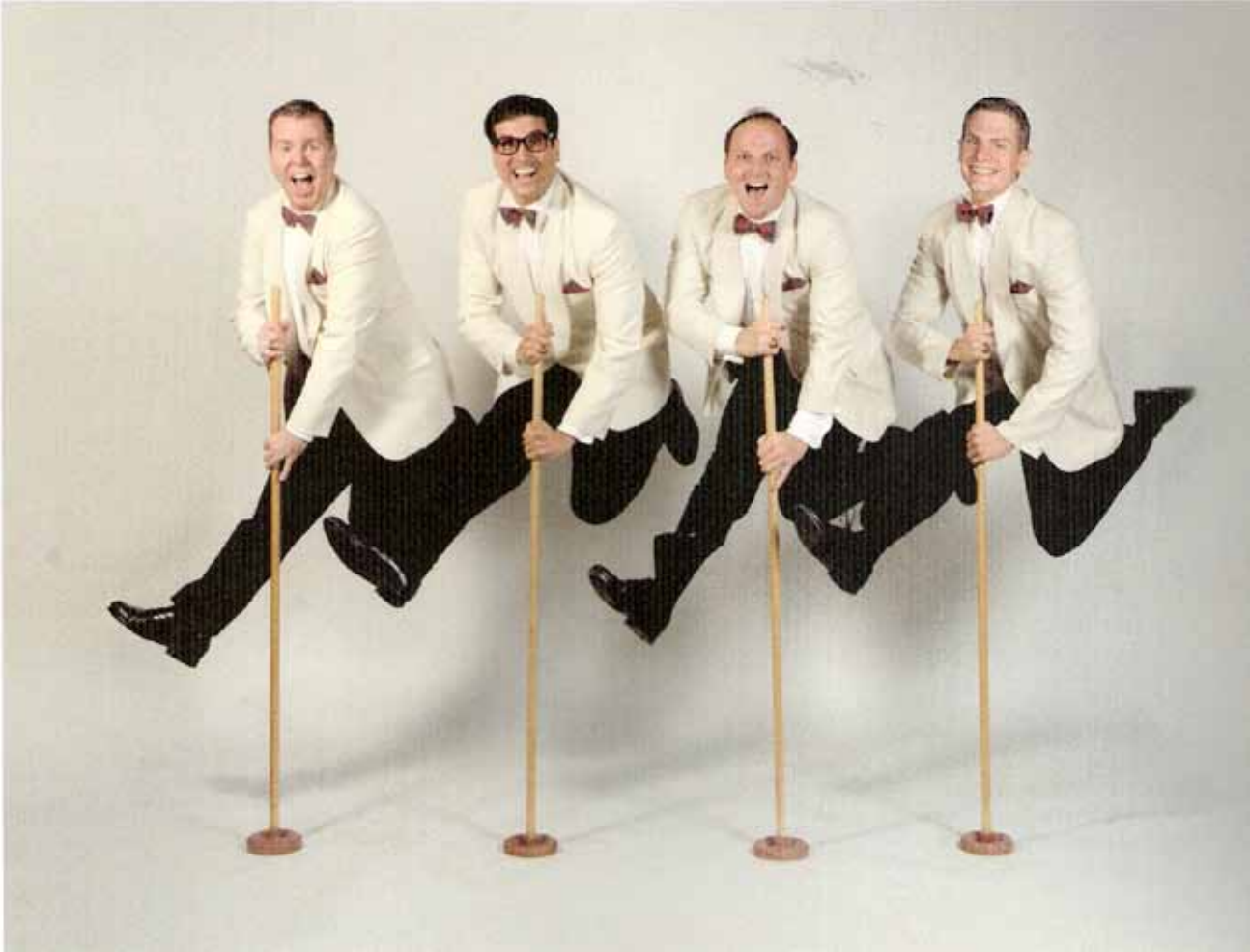
The Original Off Broadway cast

YOU WILL NEED TO PREPARE A 60'S STYLE BALLAD OR CROONER STYLE SONG. YOU MUST BRING YOUR OWN BACKING CD, NO PIANIST WILL BE PROVIDED. TO APPLY EMAIL- auditions@spotlighttheatre.com.au